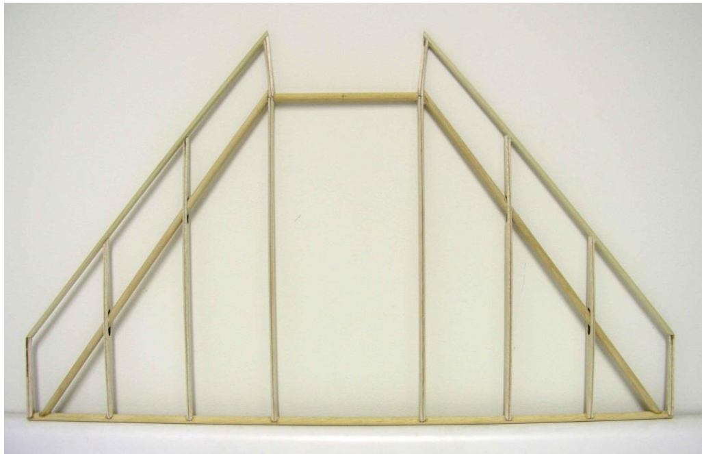
Finished stabilizer without part #67 (add that with fin)