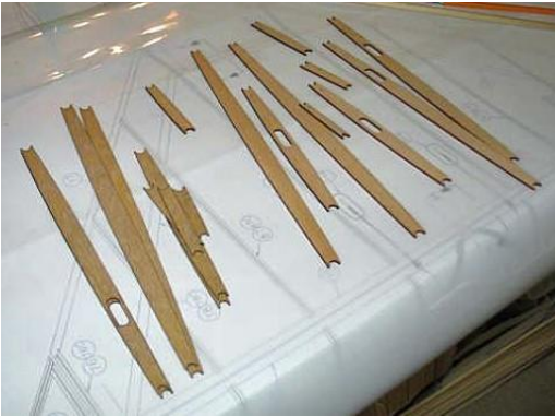
Rib parts ready to be glued together