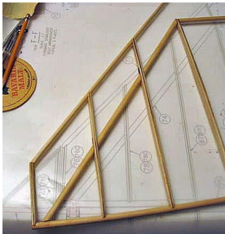
Outer dowel installed