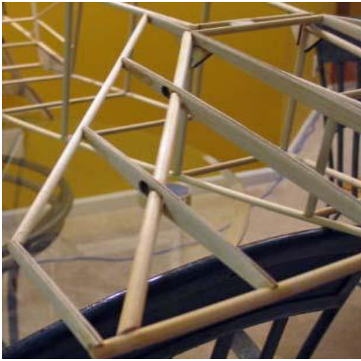
Stab positioned on fuselage