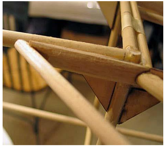
Ensure fwd rib aligns to top longeron