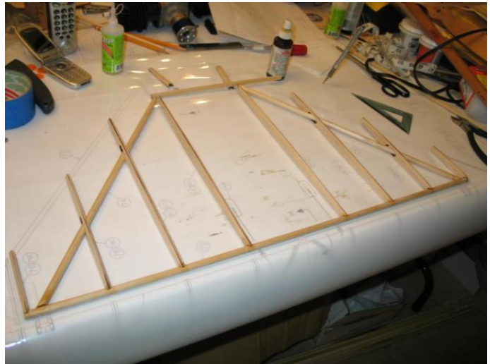
Laminated parts glued into position