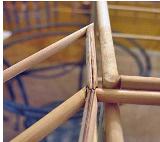
Test fit stab on fuselage; locate fwd rib