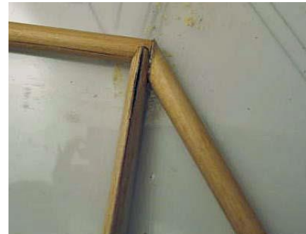
Maintain good joints